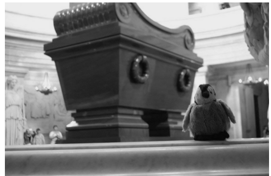
Fat Baby Penguin visiting Napoleon's Tomb in Paris, France

Once upon a time there was a little girl who had trouble falling asleep at night. One day she received a stuffed, very fat baby penguin as a gift. Little did she know that this baby penguin was a little despot who idolized Napoleon. He wished to raise an army to defend the bed and the little girl from scary thoughts of all kinds. One by one the other stuffed penguins in her bed were recruited and given ranks, titles, jobs, and even pensions. The next year on her birthday, the penguins dressed in their finery and trumpeting the songs of their people, marched in her honor and declared the little girl their president. This is the music they played in their penguin parade in honor of their favorite person and for the glory of Penglandia (aka the bed they all lived in).